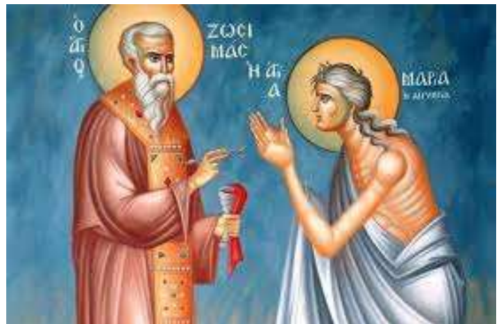
Saint Mary of Egypt and Zosimas